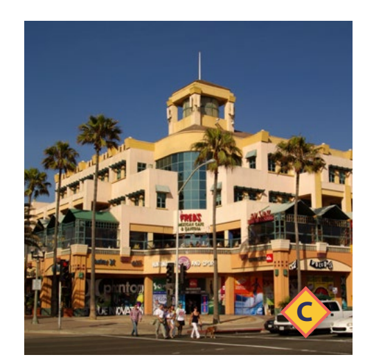
Huntington Beach Main St.