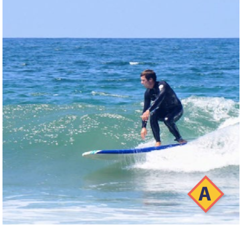
Huntington State Beach

Near the Balboa Pier, this park is the perfect place to take a break. It has barbecues, picnic tables, benches, play area and swings, restrooms, gazebo with benches and checker boards, multipurpose athletic field, water fountains and great views of the ocean and beach.