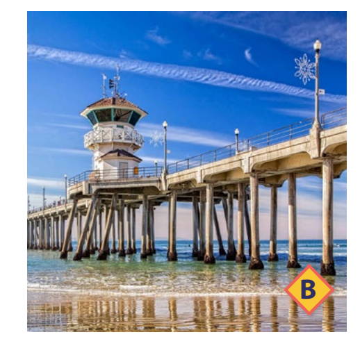
Huntington Beach Pier