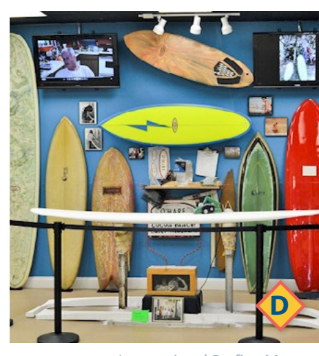
International Surfing Museum