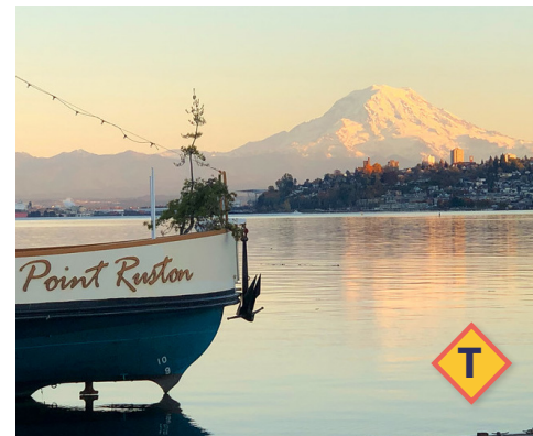
Point Ruston Historic Ferry