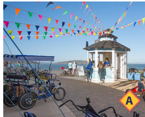
Wheel Fun Rentals Kiosk at Point Ruston