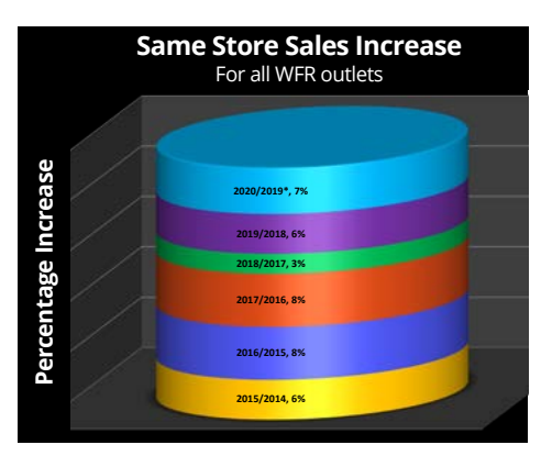
*2020 over 2019 same store sales increased in spite of a three plus month closure due to COVID-19.

Healthy same store sales increases for six straight years, in a down economy - now that's franchise support!