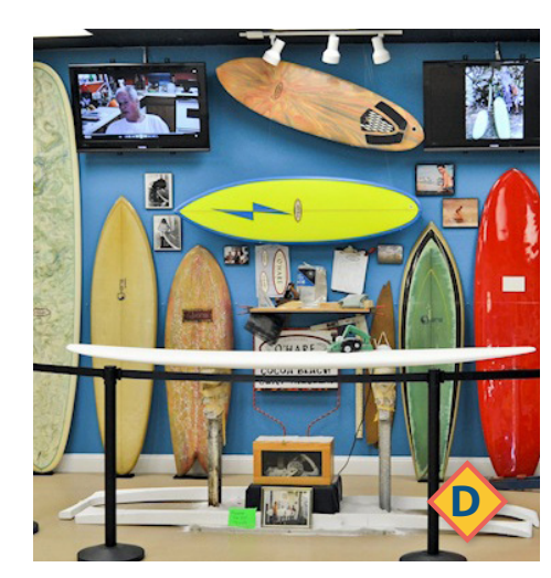
International Surfing Museum