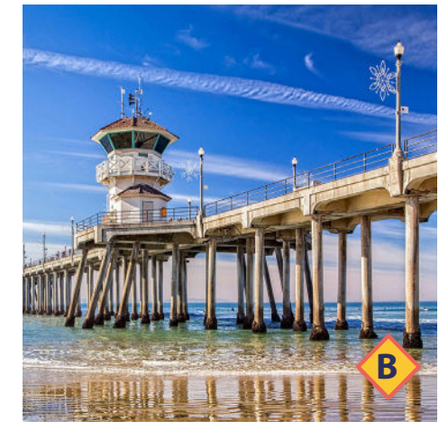
Huntington Beach Pier