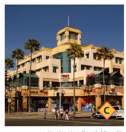
Huntington Beach Main St.