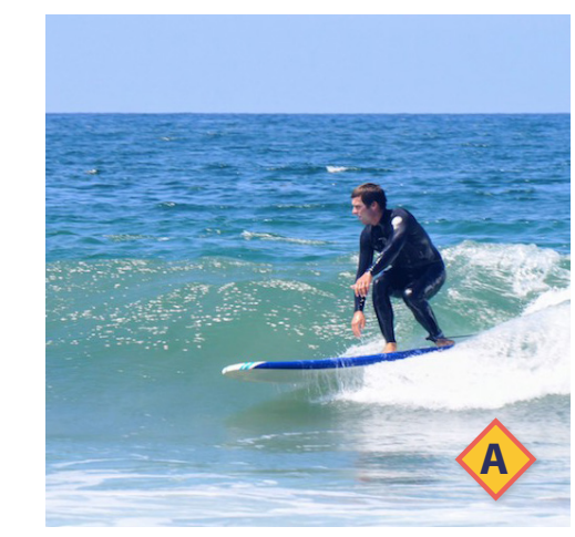
Huntington State Beach

Near the Balboa Pier, this park is the perfect place to take a break. It has barbecues, picnic tables, benches, play area and swings, restrooms, gazebo with benches and checker boards, multipurpose athletic field, water fountains and great views of the ocean and beach.