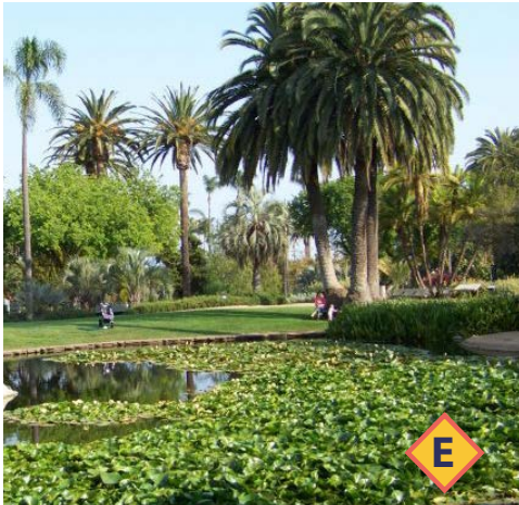
Alice Keck Memorial Park