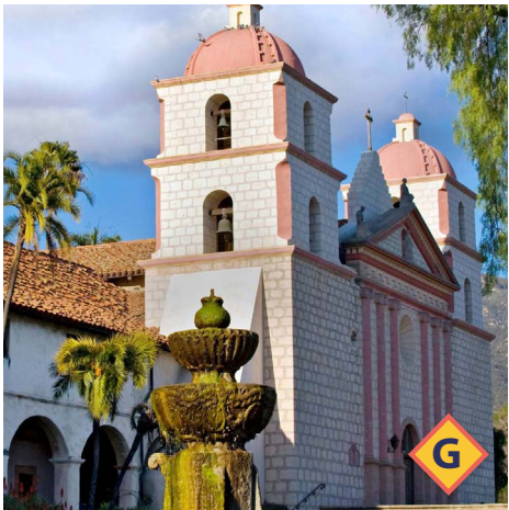
Santa Barbara Mission