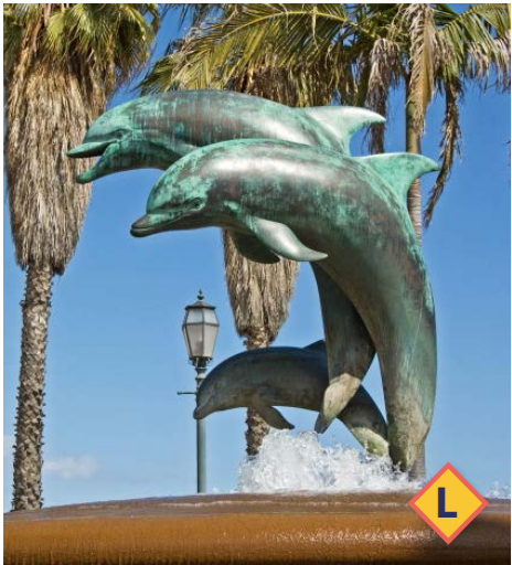
The Dolphin Fountain