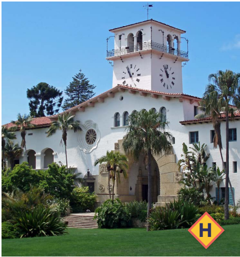
Santa Barbara Courthouse