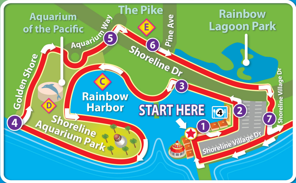
Route Detail of Starting Point (Shoreline Village)

Bike Safe! Proceed through streets and intersections carefully. Be courteous of pedestrians and don't forget water and sunscreen. For safety and comfort, wear your helmet and comfortable clothing. Obey all rules of the road... and enjoy!