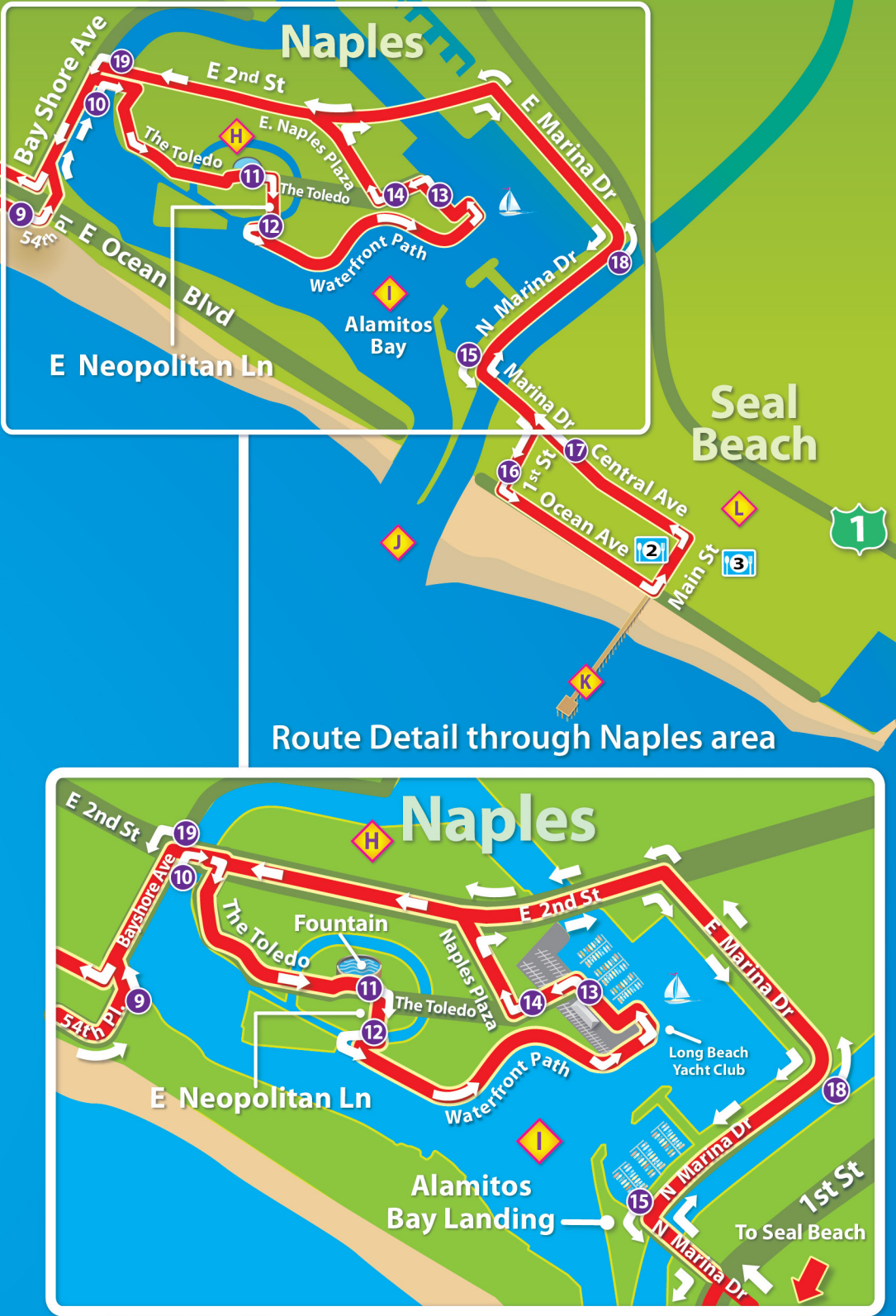
Route Detail through Naples area