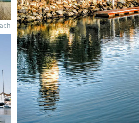
The Scarlett Belle