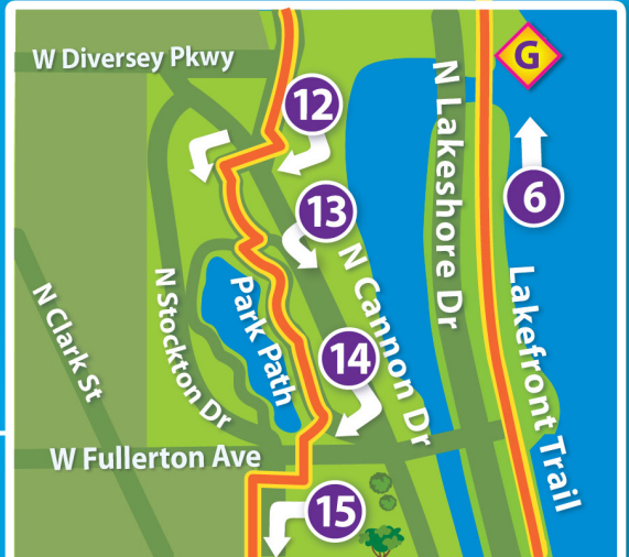
Detail of tour route from N. Lakeshore Dr. to Lincoln Park Pathway.