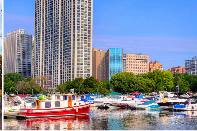
Lake Michigan Waterfront