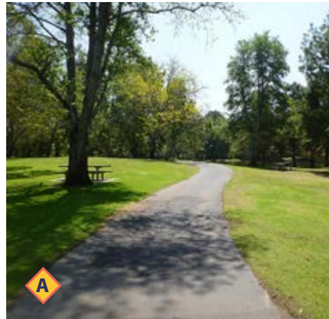
Yorba Regional Park