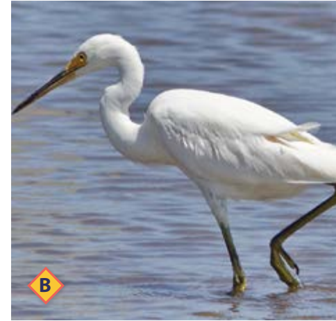
Santa Ana River