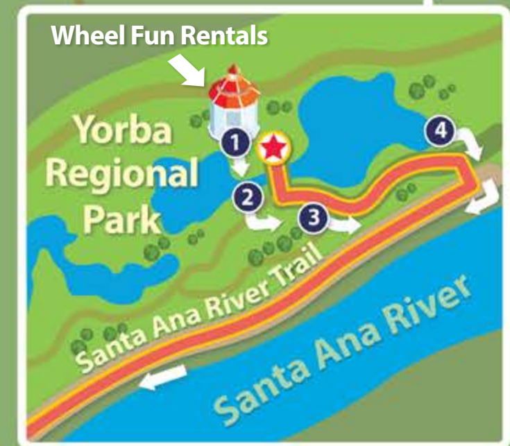
Detail of tour route leaving Wheel Fun Rentals

Wear your helmet and comfortable clothing. Don't forget water and sunscreen. This bike tour follows a multi-use path; please yield to others and keep your speed under 10mph. Bicycles must remain on the paved trail. Obey all laws and enjoy!